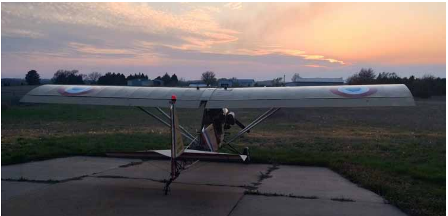
As the sun set, I pulled my AirBike into the hangar, patted its nose cowling then hopped on my motorcycle for the ride home.