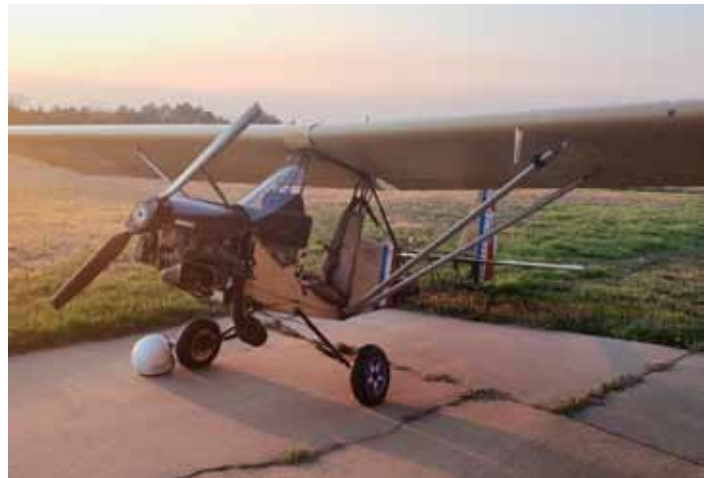
Photo taken into the sun following post-flight inspection makes it look like it is foggy.