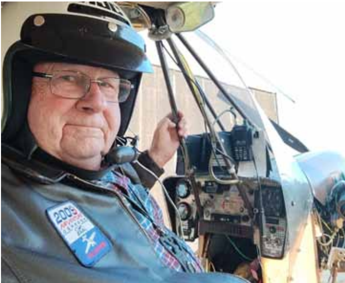
Aerial photos in the smoke were pointless. This ground photo of me in the cockpit was much clearer.