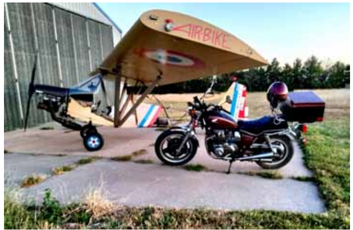
Although this photo was taken following an earlier flight, it does illustrate my two favorite transportation methods.

I like to share my flying experiences as much as I like to fly. Hopefully, you found this interesting.