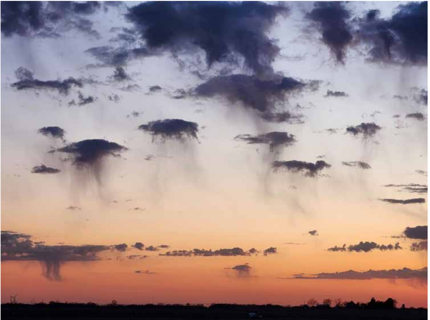
CHRISTI HIGGINS of Western, NE took this photo and named it "Nebraska Jelly Fish".

Please help support EAA 377 by paying $20 dues for 2024.