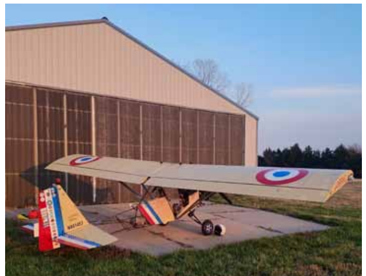
Although the sky looks pristine, it is deceiving. Smoke just above ground level to at least 5000 feet AGL was intolerable.

With the AirBike post-flighted, I pulled it into its