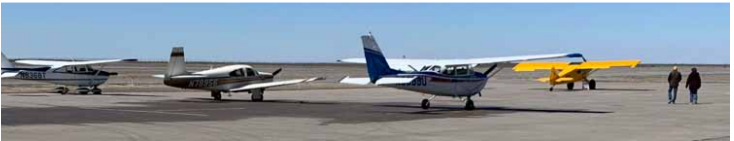
KGCK Ramp last month.