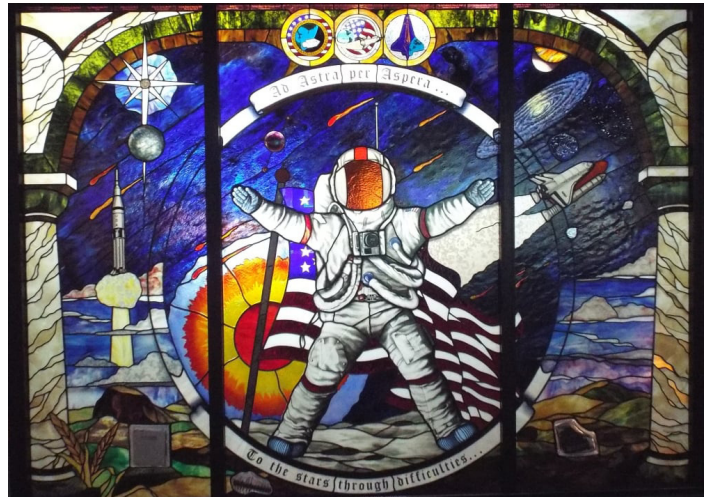
Cosmosphere International SciEd Center and Space Museum in Hutchinson, KS