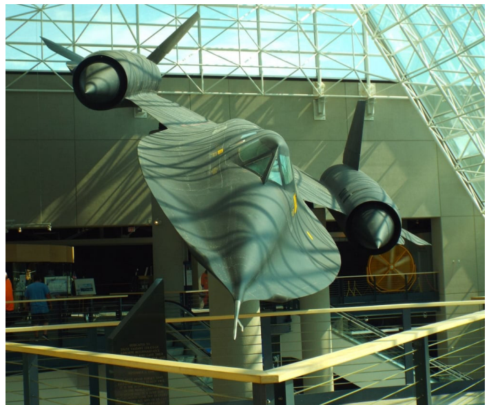
The Strategic Air Command (SAC) & Aerospace Museum - Ashland, NE