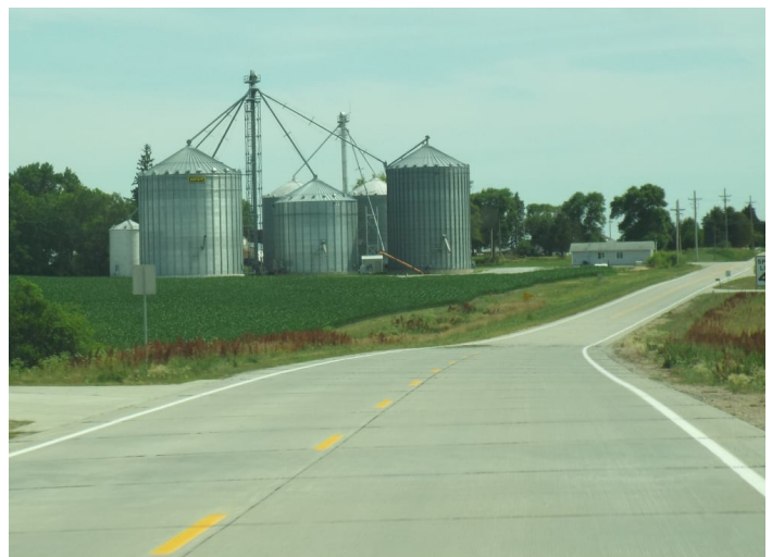
Next visit will include a ride on a combine!