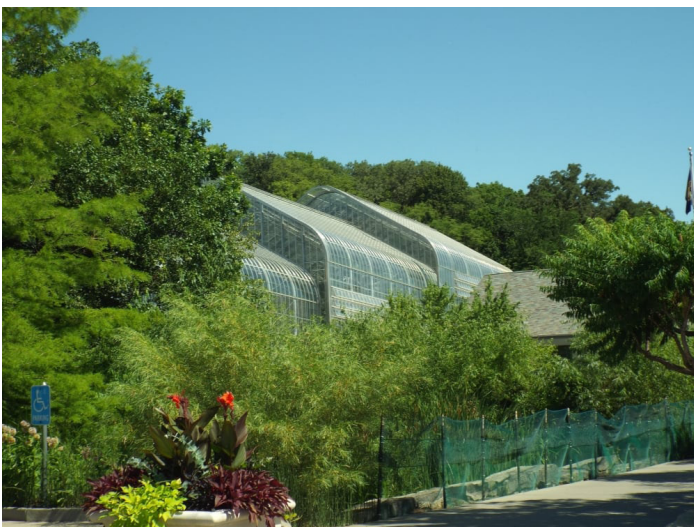
Lauritzen Gardens, Omaha, NE