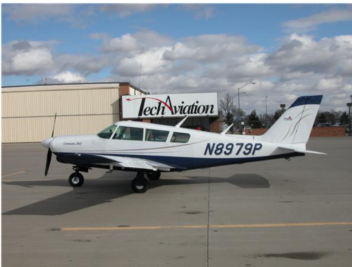
It is not surprising that fond memories of an airplane from childhood not only sparked a desire to learn to fly, but sharing that love of airplanes and aviation is something to be passed along to future generations. Makes me want to pull Thumper out of the hangar, and go fly! ~Mary