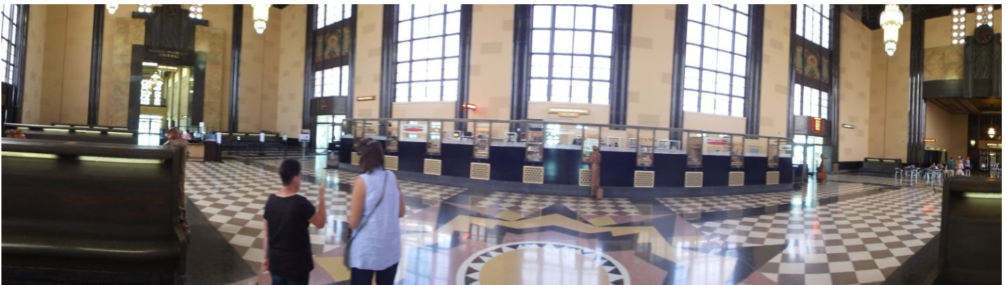
Durham Museum located in Omaha, Nebraska's Union Station.