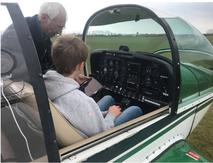
My son is 11. My daughter 13. My daughter was flying a C172. My son was in a Robin DR400