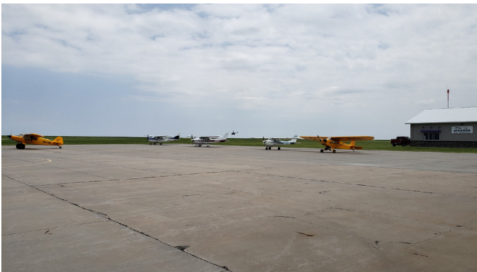
If you blow up area between to high wing Cessna's you can see the R-66 hovering near the runway.