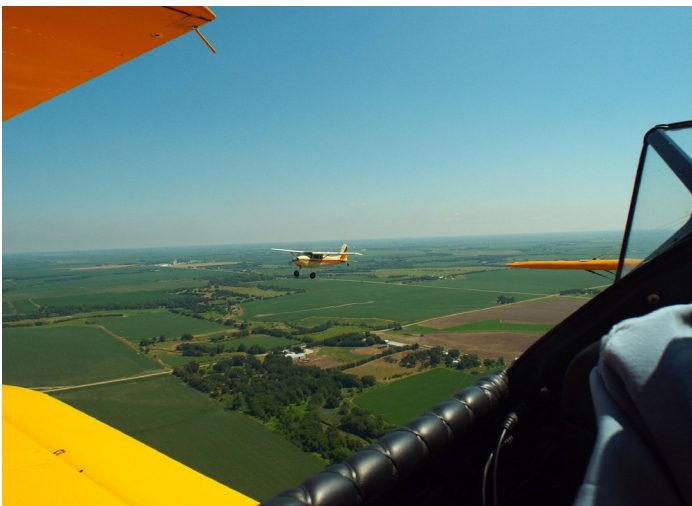
Racing to KHSI to land before the airport closed for airshow!