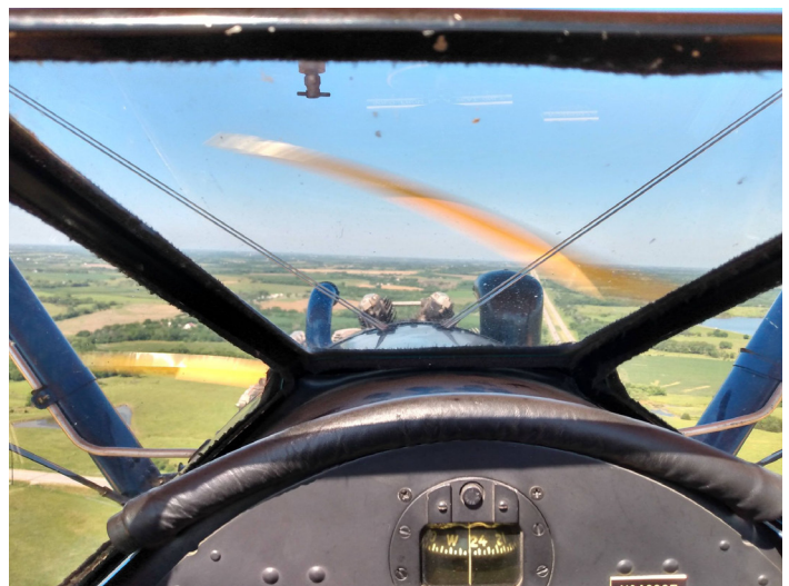
Nothing like an open cockpit!