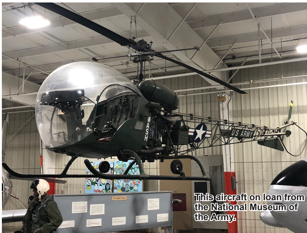
This aircraft on loan from the National Museum of the Army.

This month's featured aircraft is the Bell H-13 Sioux also known as the R-13 Sioux and the Sioux 47. The Bell Aircraft Company was founded on July 10, 1935 in Buffalo, NY by Larry Bell. While most people today probably associate Bell Aircraft with helicopters such as the Huey, Cobra, and Jet Ranger these iconic helicopters all had their roots going back to 1941 when Bell was already working on their first full scale helicopter the Bell 30. The Bell 30 flew for the first time on December 29, 1942. This eventually evolved into the H-13 which most people probably associate with the TV Series "MASH." Other famous Bell aircraft include the P-39 Airacobra, the P-59 Airacomet (America's first attempt at building a jet fighter that never went into full scale production but did fly before the British Gloster Meteor), the Bell X-1, X-2, and X-15 rockets planes and the V-22 Osprey which can occasionally be seen flying behind our museum. Bell claims the helicopter is a 3-seater, but 2 seats is a far more comfortable number. The aircraft is 31 feet 7 inches long, 9 feet 8 inches high, has a gross weight of 2952 pounds, and is equipped with a Lycoming TVO-435-A1 six-cylinder engine producing 260 hp. The maximum speed is rated at 105 mph with a cruise speed of 84 mph, and range of 273 miles. Over 5600 have been produced. The chief designer was Arthur M Young. In 1957 Bell further developed the helicopter into the Bell 201 which had a turbine engine.