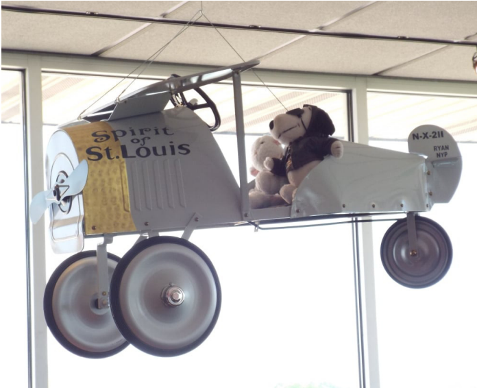
Speedway Motors Museum of American Speed in Lincoln, NE