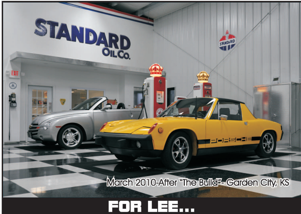
March 2010-After "The Build"- Garden City, KS