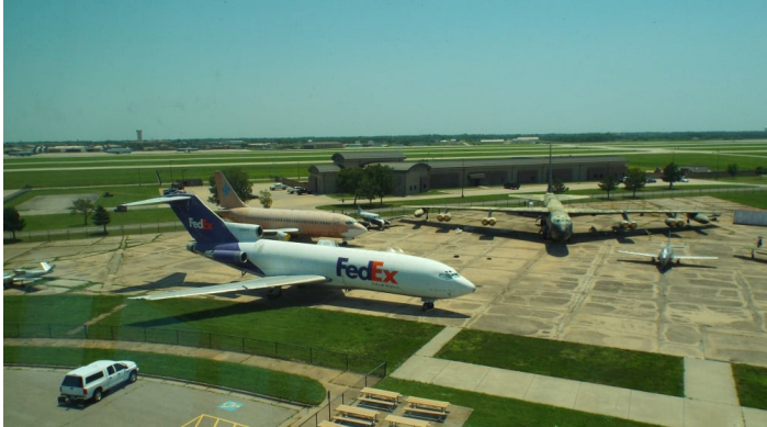
Kansas Aviation Museum located in Wichita, KS Municipal Airport (1930-1954)