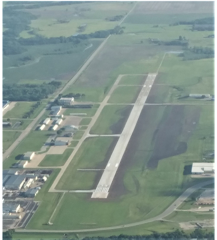
Ponca City Newspaper article describing the work as it was beginning.

Ponca City Open House after runway rebuild project. Nearly 3/4 of the runway was replaced due to cracking, holes, rough surface. Here's an aerial that I took after the concrete was finished but before the runway was opened.