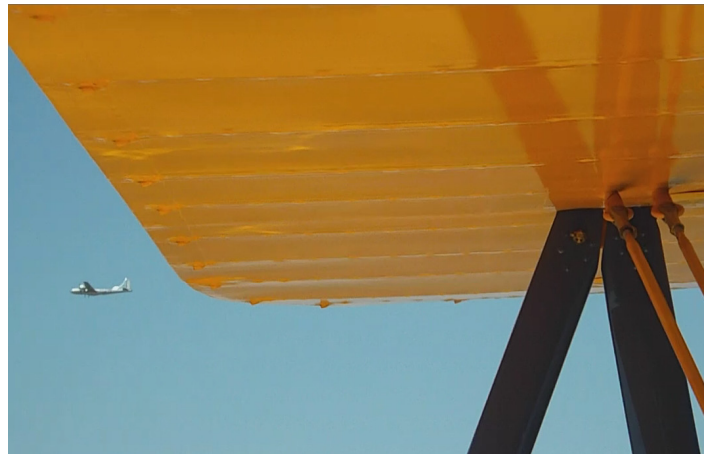
Nothing like seeing a B29 in the air from the front seat of a Stearman!