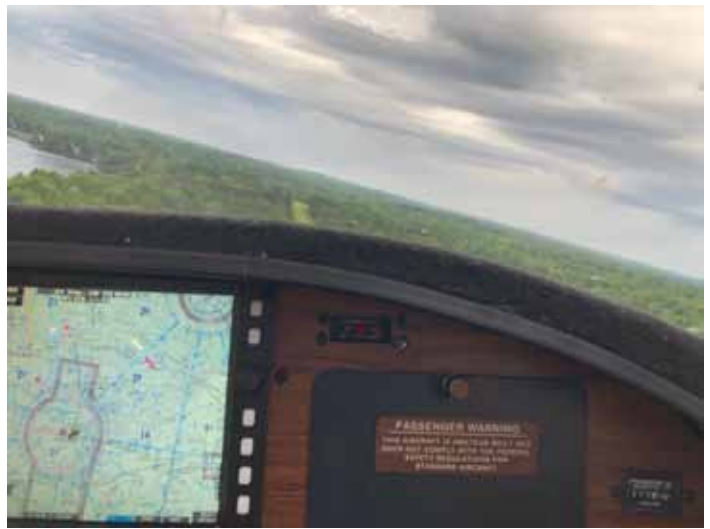
Their grass strip at 12:00. Those trees were TALL!