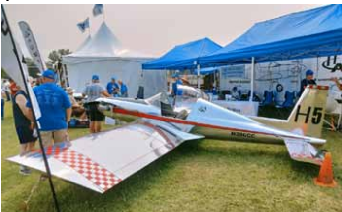
Hummel Aviation had two planes on display