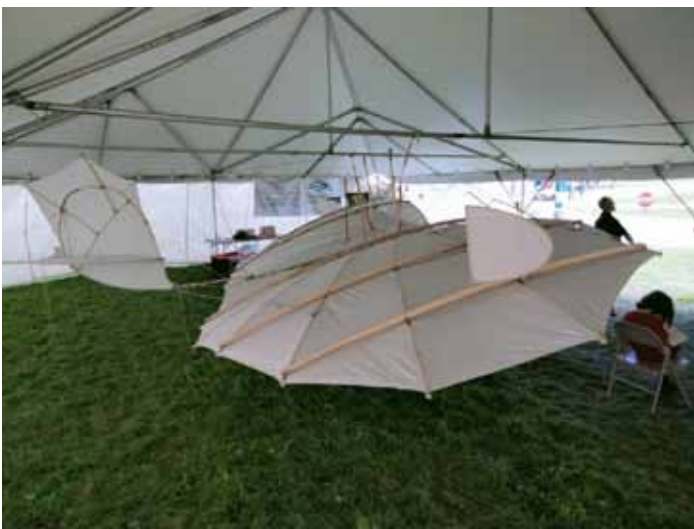
In 1896 Otto Lilienthal designed and flew his Vorflugelapparat glider. Note the similarities to today's aircraft that use winglets, and leading edge slats.