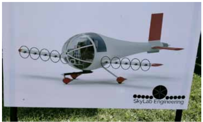
Many aircraft designs capitalize on the "Blown Wing" concept and fueled engines generating power for electric wing mounted motors.