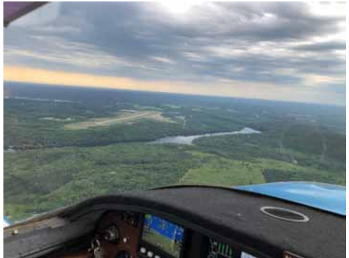
Iron Mountain KIMT