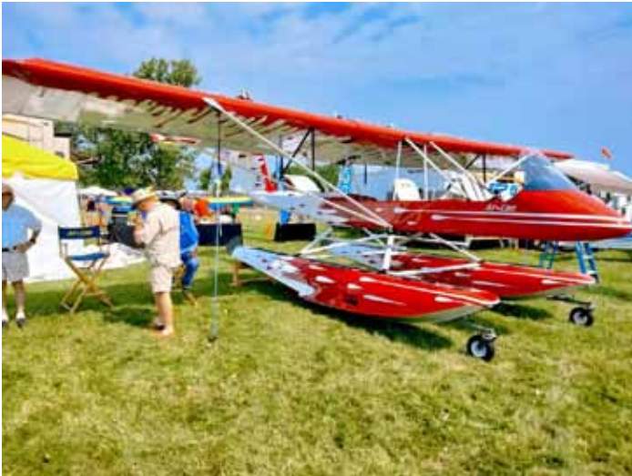
Two Air Cams were on display, both on floats.

All was not work though, while on assignment I took photos of things that caught my interest. Some of these and many other have been sent along with my story to PSF magazine for publication later in the year.