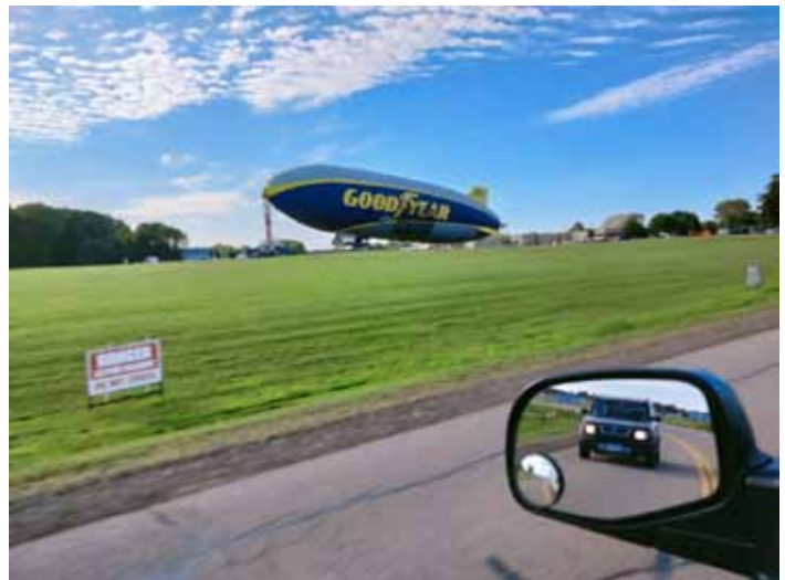
The Goodyear blimp once again made an appearance and flew daily.