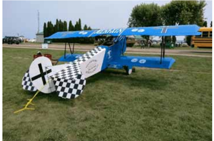
Aerodrome Aeroplanes had this Fokker D.VII on display in the Replica Display area.