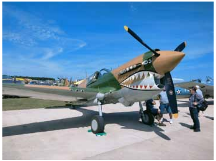
The Warbird Area always displays magnificent restorations of WWII aircraft. I believe this is a P-40 Warhawk.