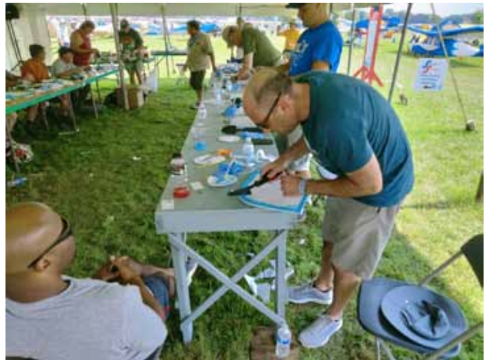
An abundance of vendors had workshops throughout the grounds, this one is for teaching how to use the Stewart fabric application process. I used this on my Tiger Moth.