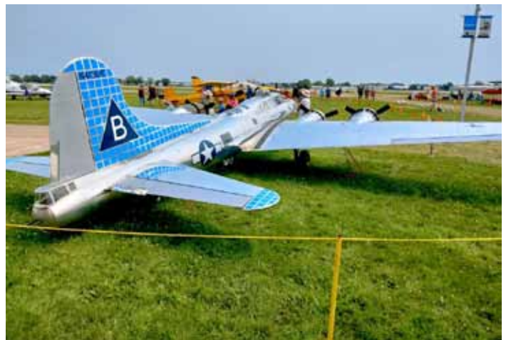
The Bally Bomber was flown in by its new owner. Another designer is considering building a 4-seat half scale B-17. Imagine that!