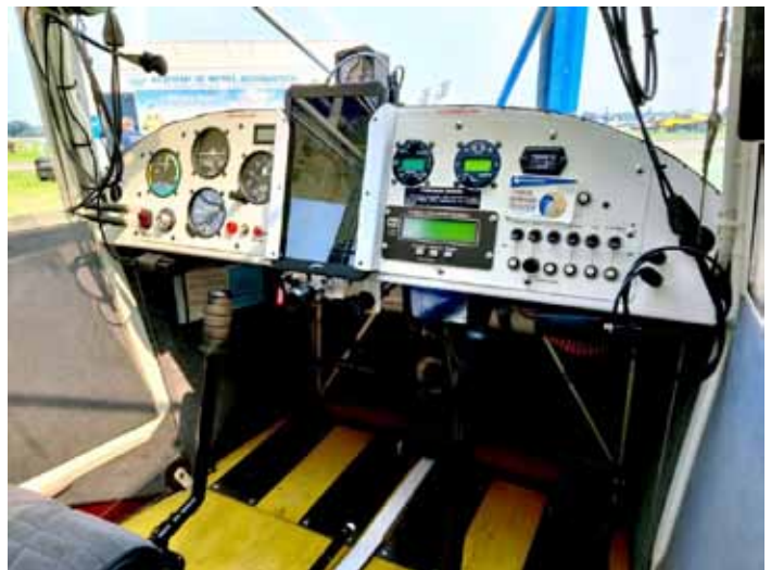
TEAM's newly acquired Sparrow two-seater high-wing plane was on display and may soon be in production.