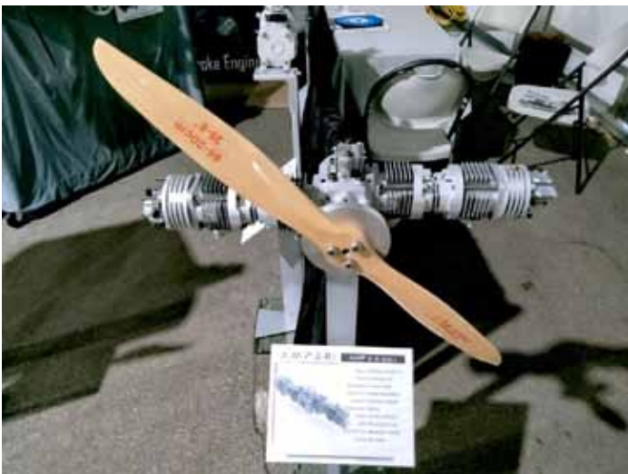
AMPERe dual piston, single-stroke (yes single-stroke) fueled engine.