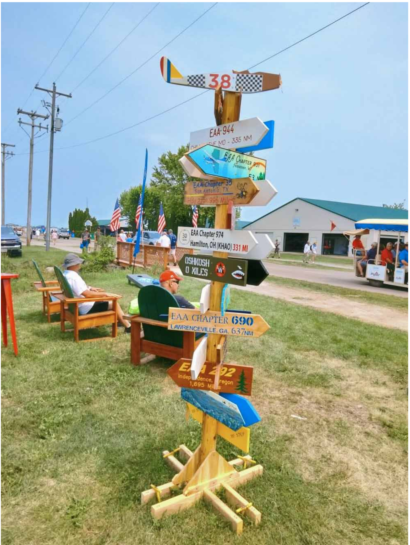
Distance/location sign (a-la-MASH) for EAA chapters.