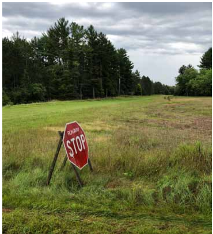
Trask's grass runway in their front yard!