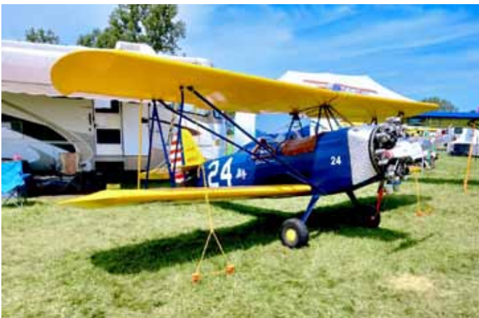
A Fisher Celebrity with a Rotec radial engine was certainly a show stopper.