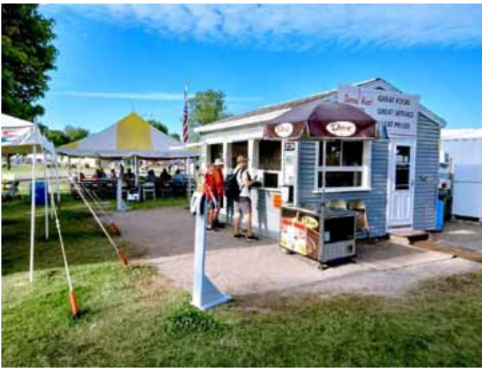
Sacred Heart food pavilion is always a good place for breakfast or meals throughout the day.