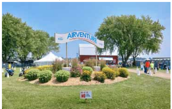
The Red Barn in the ultralight area (Down on the Farm) has a new welcome display.