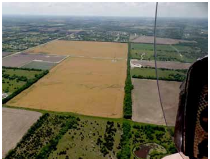
Wheat field ready for harvesting. Sometimes I wave to farmers as they go about their tasks.