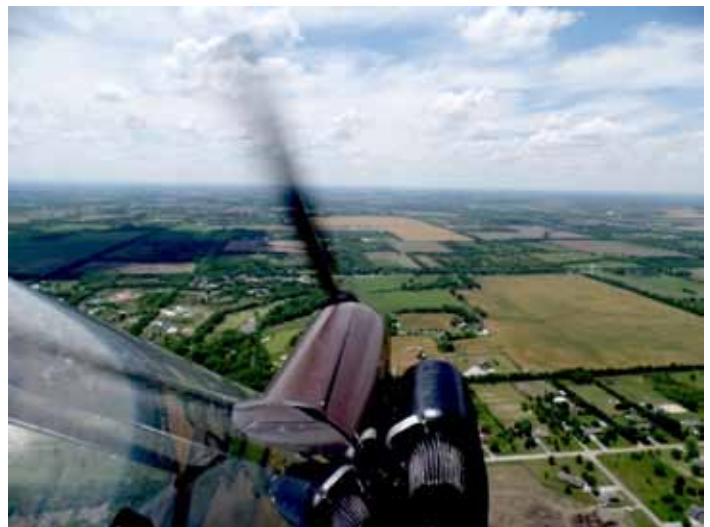
The over-the-cowl photos provide an interesting view that I see from 1000’.