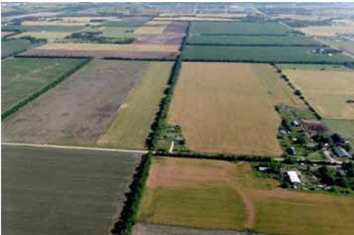
Field colors vary with the degree of planting, growth, and readiness for harvesting.