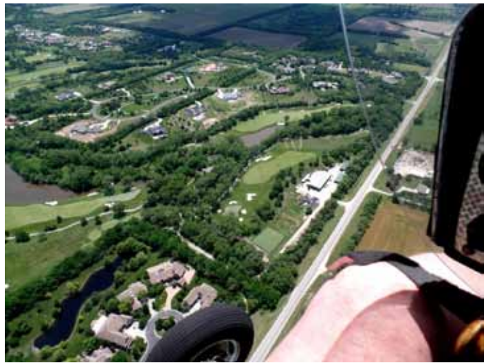
Subdivision nestled in around a golf course near Wichita, KS.