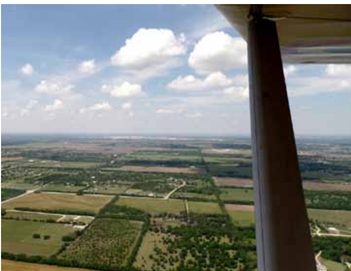
Beauty is where you find it, this is my idea of an attractive landscape.