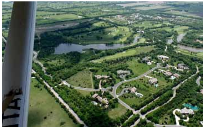
Another view of a combination golf course/residential community. The ponds are frequently created as a planned part of the construction.