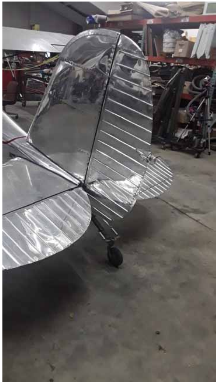
ADS-B (Uvionx) works from tail light position! (yes, new tail springs/chain, etc)