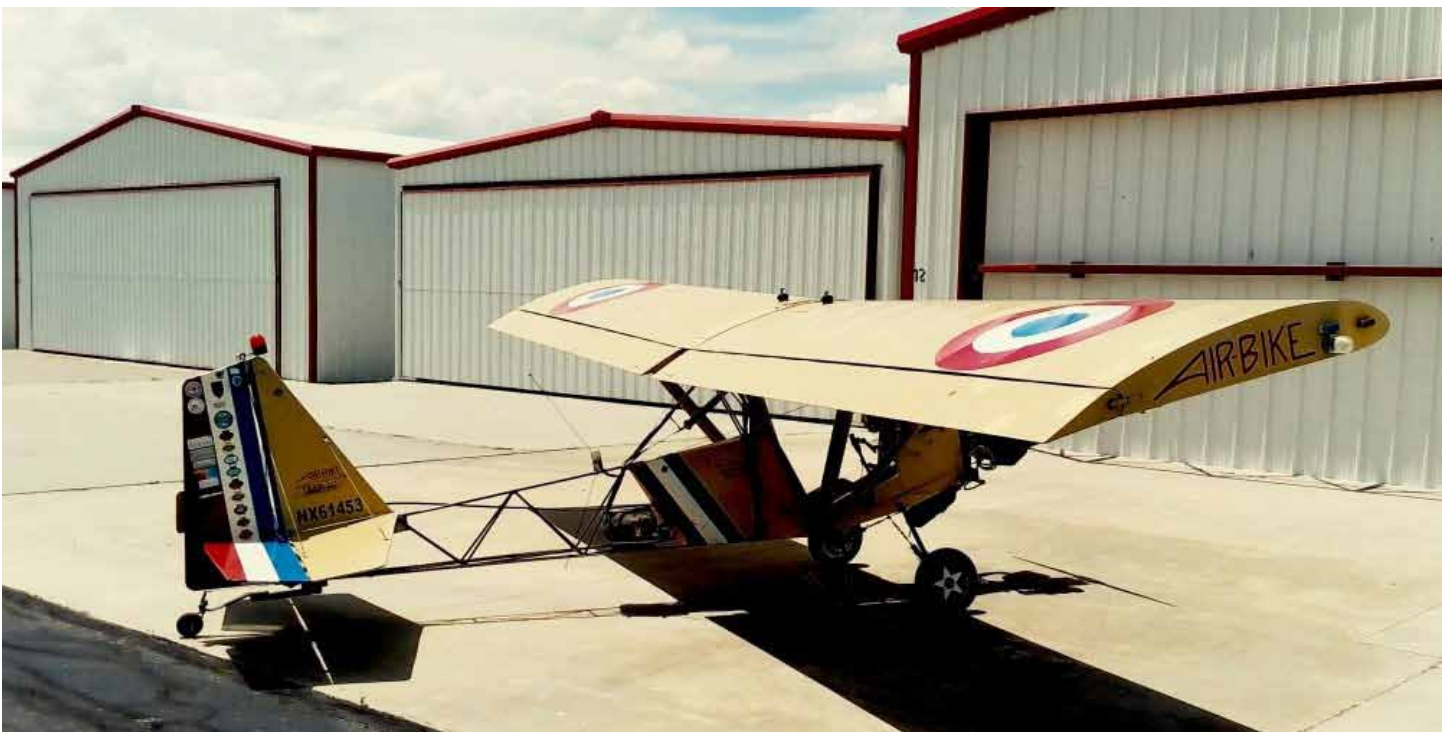
Back home and ready to be tucked away in the hangar, my AirBike has again been my venue for fun, expression, and a safe ride. Never in my life while building this plane 23 years ago did I ever think it would take me so many places and bring so much enjoyment. Life is good!