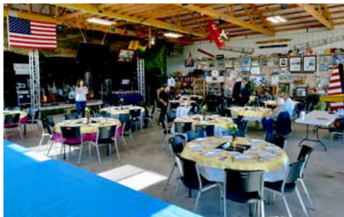
Dining area, stage, and wall memorabilia