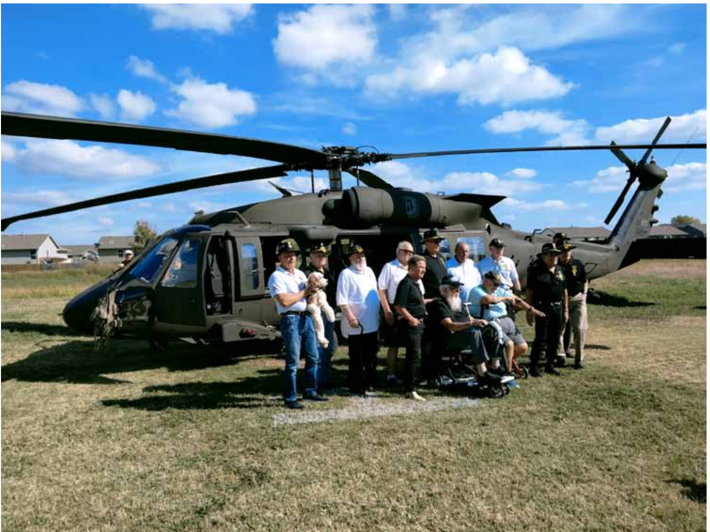
Charlie Co. Vets---Veterans posing with the Blackhawk helicopter

the country. Perhaps it was intended to have that double meaning?