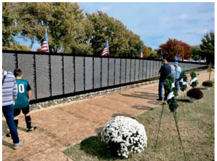
Replica Vietnam Memorial Wall