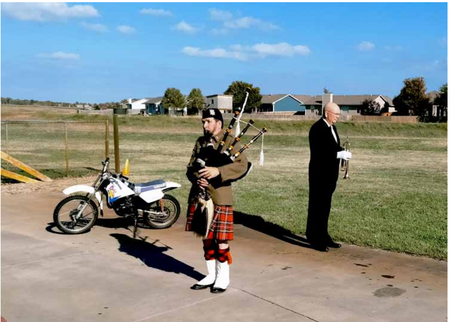
Bagpiper & Bugler---Musicians each struck a chord with the audience