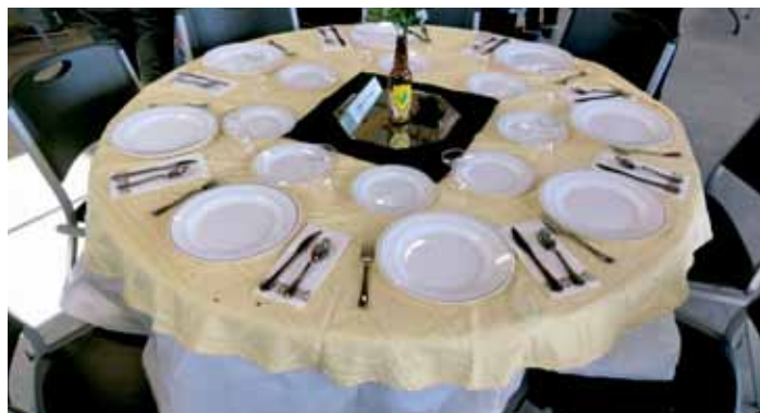
Table setting for eight Veterans and their spouses