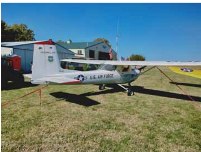
Wayne Bormann's Cessna 150 detailed as a military plane

were encouraged to explore various Valley Center restaurants and the local parks on their own.