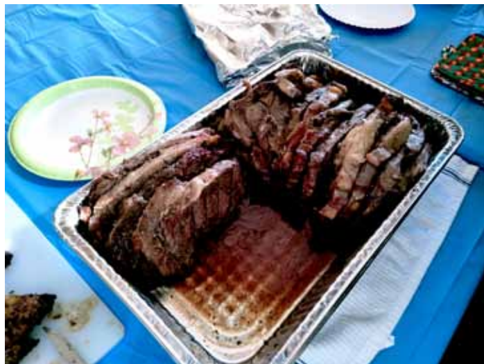
Rib Eye steaks hot off the grill and to the serving line

On Friday the All American Beef Battalion from Great Bend donated and served huge Rib eye steaks for the noon meal. Zach Braum spent days preparing and providing all the ingredients for his homemade spaghetti sauce, meat balls, and noodles for supper. It was a real Italian meal complete with garlic bread. Side dishes were also provided by the caterers and participants. All kitchen preparations, table settings, and clean up services were provided by numerous volunteering friends.