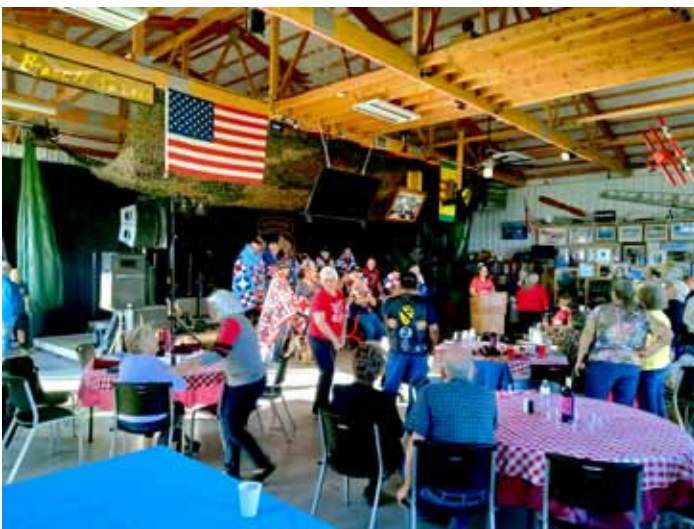
Greater Wichita Area Quilters of Valor presented hand made quilts to each Veteran