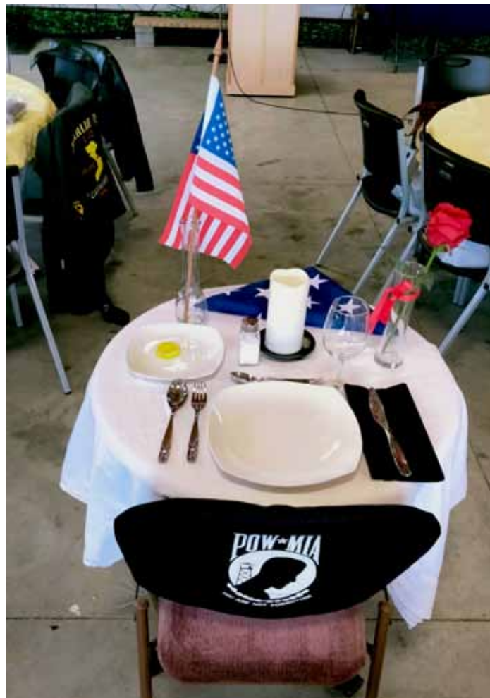
Ceremonial dinner seating display for Missing Soldier