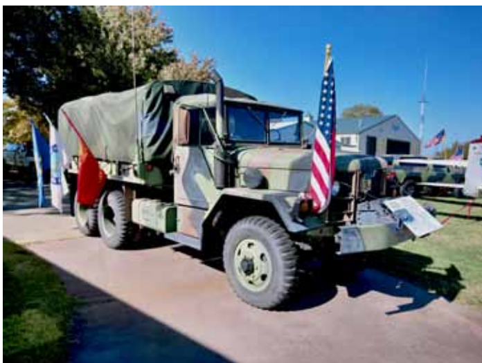
Typical Duce & a Half used in Vietnam