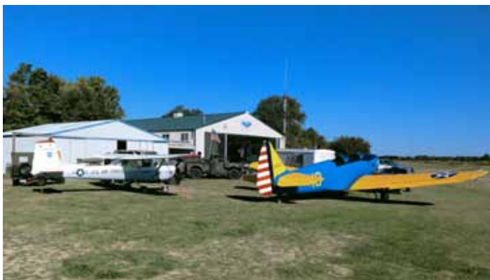
Cessna 150 and PT-19 on display