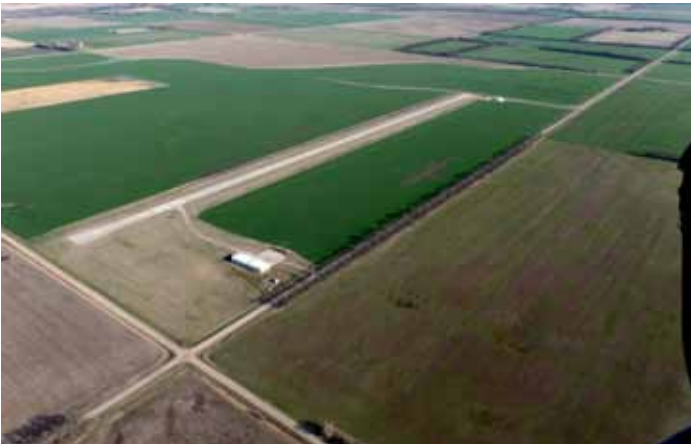
Oxford, KS 55K runway~ Oxford airfield is a very nice paved runway. The hangars house multiple planes.

AOPA Air Safety Foundation resources are available to everyone! A pilot certificate number is required to download an online course completion certificate, but you can just enter a “dummy” number (such as 0 or 123) in the pilot certificate number field. If you do have a pilot certificate, be sure to enter the number correctly, especially if you plan to participate in AOPA Accident Forgiveness or the FAA WINGS Program.