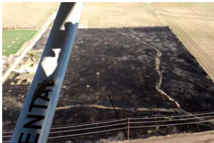
Burned field~ This burned field is now awaiting the sun to warm the Brome hay so it can produce another crop.

Temperature was just under 60 degrees and the sky mostly clear, however the pungent odor of burning grass and intermittent smoke haze detracted somewhat from the flight. At this time of year, farmers burn their fields on a three-year rotational basis. This eliminates weed seeds and allows the sun's heat to warm the earth for this year's emerging Brome Hay.