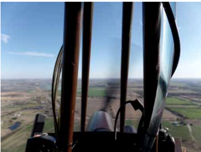
Cockpit forward view~ The direct forward view from the cockpit has these obstructions. The camera is much closer to these tubes than my head is, thus making them look like they consume most of the forward viewing; they don't.

Leaving Cook Airfield (K50) I headed almost due South for 30 miles to Oxford Field (55K) as opposed to my normal local flying. I was mostly reassuring my confidence in the GPS and just wanted to go someplace I hadn't been in a few years.