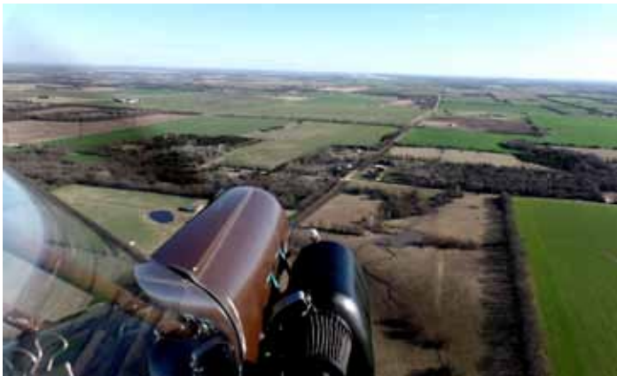
Cropland over cowl~ Sticking my head out of the cockpit and into the windstream provides this unobstructed view. I keep my mouth closed lest bugs get stuck in my teeth!

The off and on again rains have ceased (for now) and a window opened up Sunday March 28 that was suitable for flying. That day was and is bordered by winds gusting to 50 mph, but Sunday the winds were 10 mph with gusts at 1000 feet at 20 mph. Certainly tolerable weather for an hour of pleasure flying.