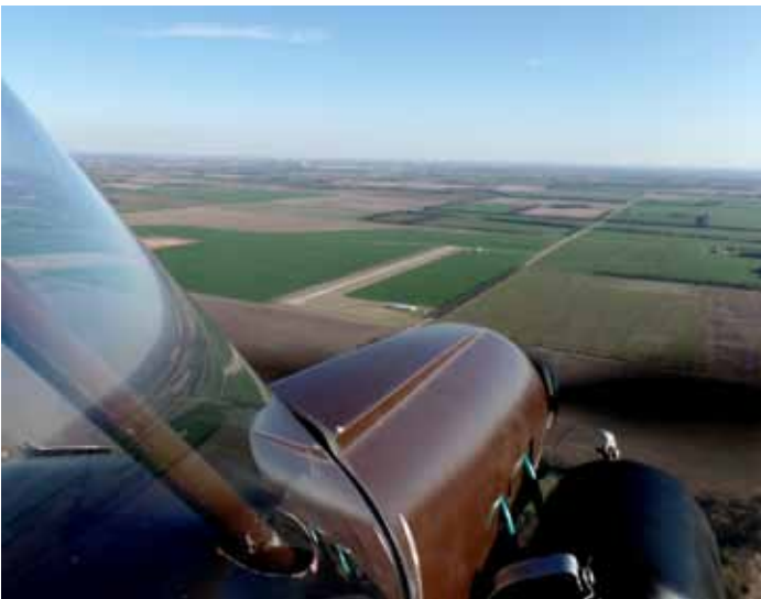
Oxford, KS 55K over cowl~ The Oxford airfield (55K) just a few miles west of Oxford, KS was this flight's destination. There was no activity evident so I did not land to visit friends who hangar there.