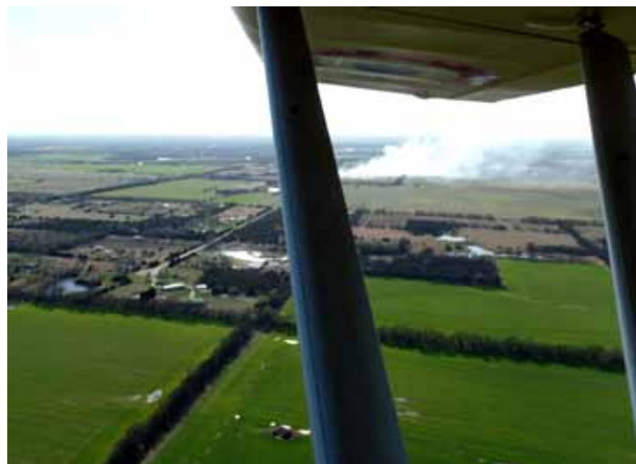
Smoke thru the struts~ Most farmers observe a three-year rotation burning of their fields.

Enjoy the photos of my little flight, there will be more. Hopefully I can join up with others for those $25 hamburgers. (The $100 burger costs less in my AirBike!)