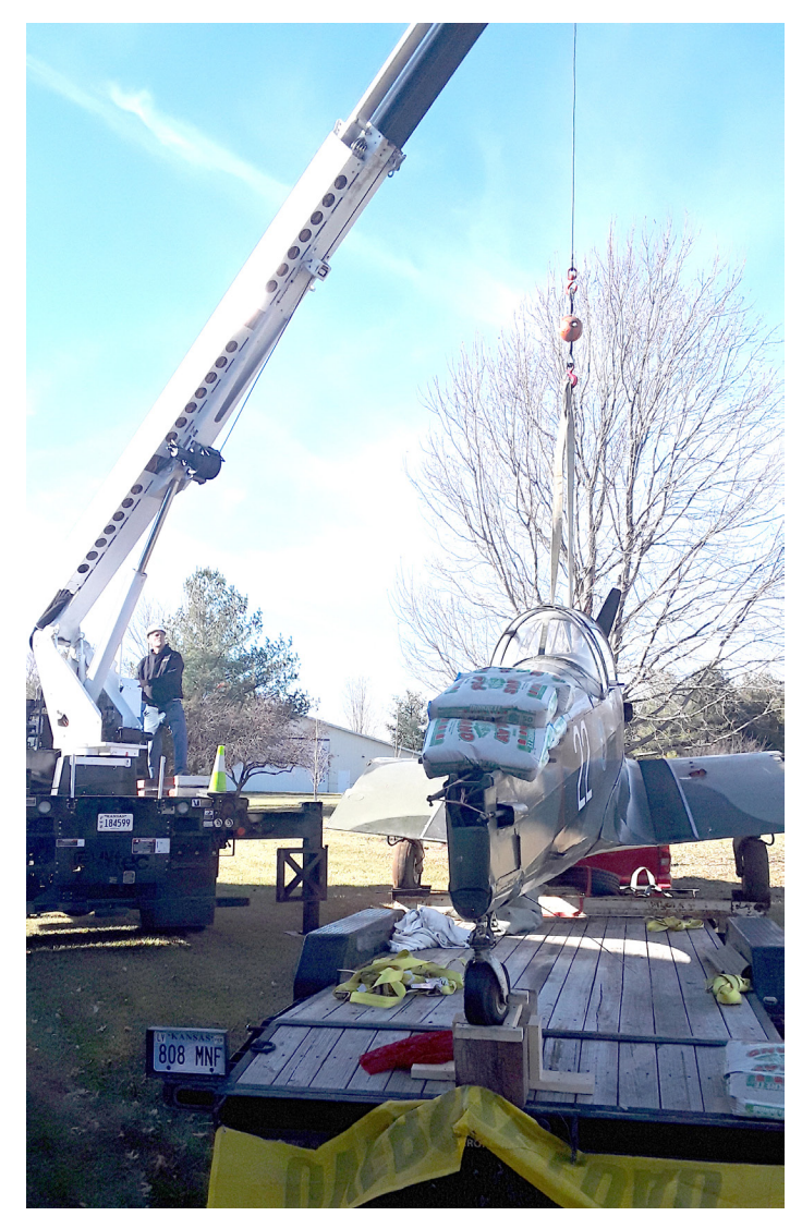
A large crane makes short work and a Safe Offload! After adding five 60 pound bags of sand (the stabilizing "trick" folks at USAF Museum showed me ... IT WORKED!) and offload was smooth.