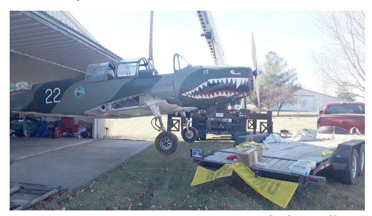
The crane operator moved PT-26 Safely off the trailer & into the hangar as the weather began to change.