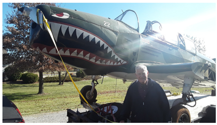
PT-26 fluids had all been drained off in July 1984 when it was flown to Wright-patterson & USAF Museum from the donor's home in Boston, MA. After loading the PT-26 at the Museum, a short drive back to motel showed us the propeller "TURNED in the WIND!"