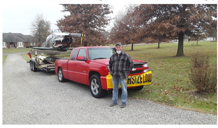
Travel day was Nov 21 and arrival home about 9 pm. Long day and we "burned" a lot of gas with this OVERSIZE Load.

(600 miles with NO Oil for lubricant may have added some "wear" on engine with the prop turning!)