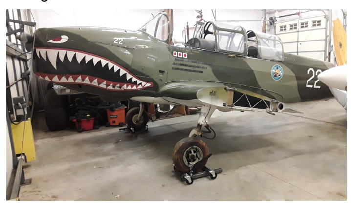
PT-26 inside with wings on roll around. Nose of NORMAN BEUHLER built Thorp T-18 at right of photo.

The PT26 project got offloaded smoothly on November 26, 2019 and rolled into the hangar. Wings are on a separate rollaround.