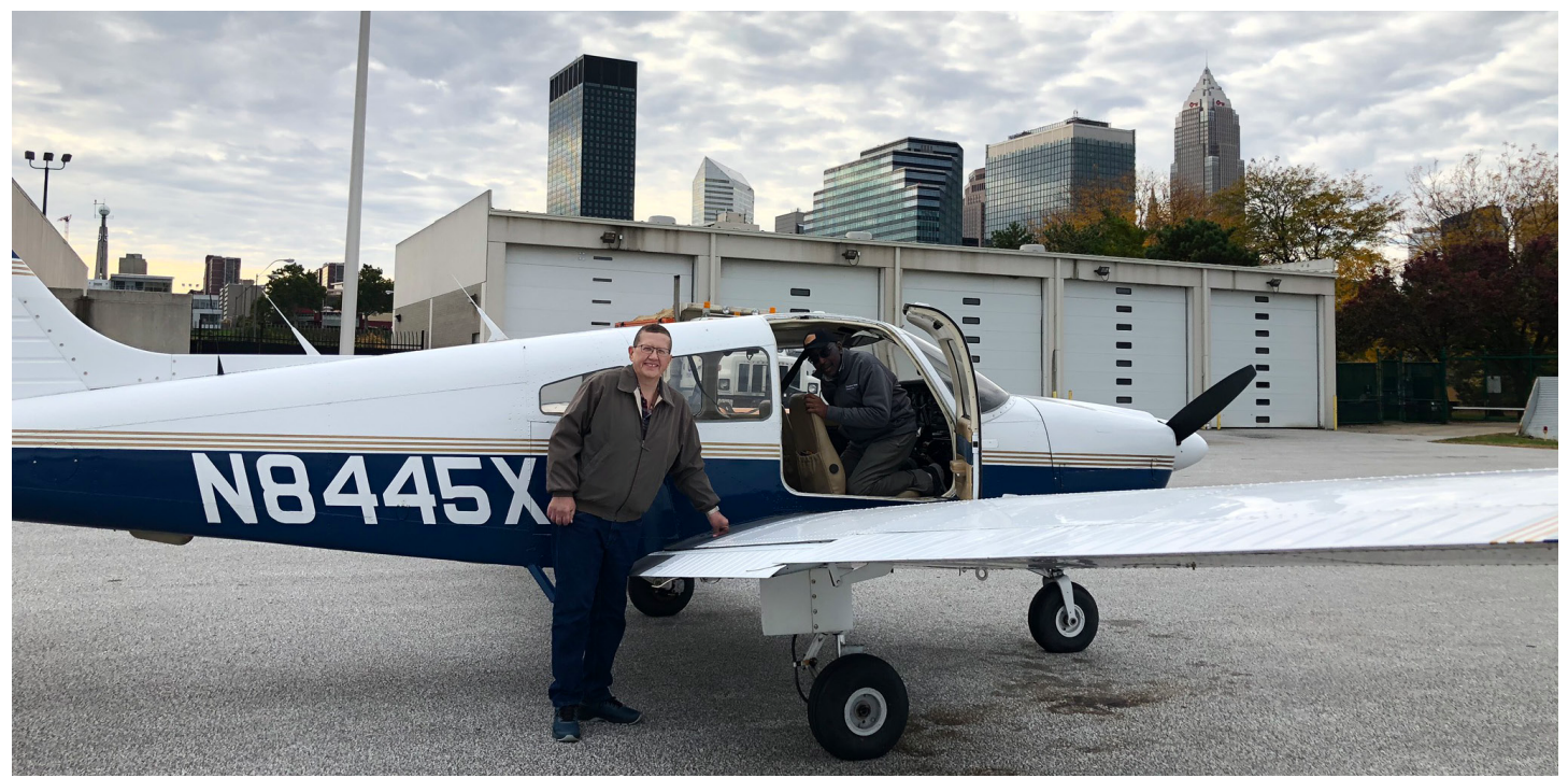
"Kindness can transform soneone's dark moment with a blaze of light. You'll never know how much your caring matters." —Amy Leigh Mercree