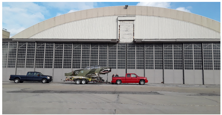
Photo in front of old hangar that housed Presidential Aircraft until moving into new Museum Building 4.