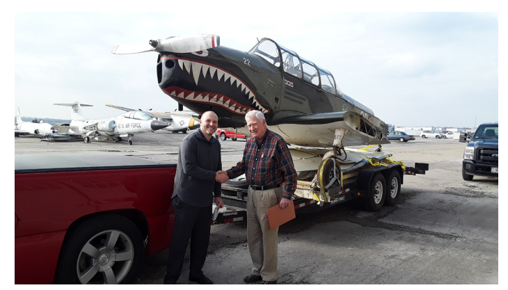
USAF Museum Project Manager signs "exchange" documents plus Bill of Sale (FAA form)