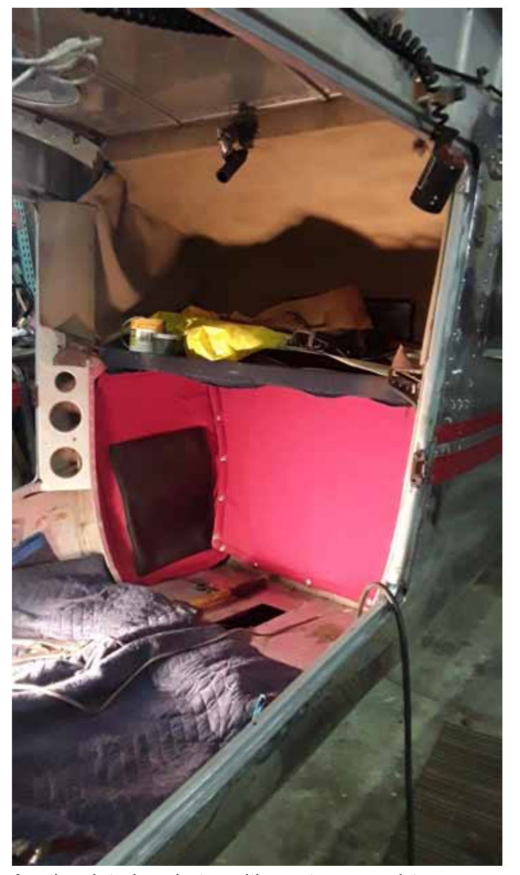
Another interior photo, with seat removed to access space below the unfinished "hat rack" but, a new, red, silencing pad reinstalled just in front of battery and it's