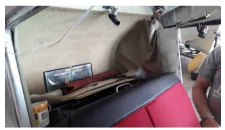
Seats recovered and in place. Interior, door panels, etc to go, including this "hat rack" that's not found in current models.