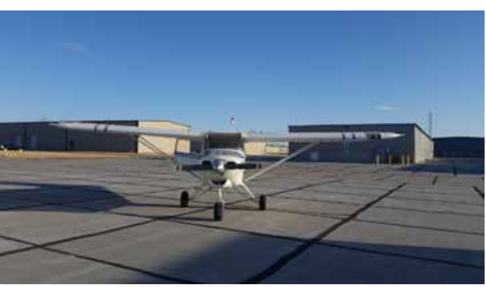
August 2020—page 9 (on-line only)