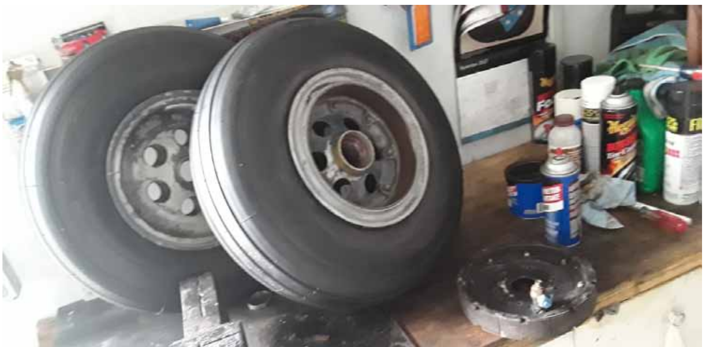
New tires mounted/cleaned up with new races inserted. (races is the term for the metal ring the tapered roller-bearings ride on/in.) Races inserted in hub and bearings to grease and set in the hub in the race. Now waiting on delivery of 1944 instruction manual for "how to do it!"