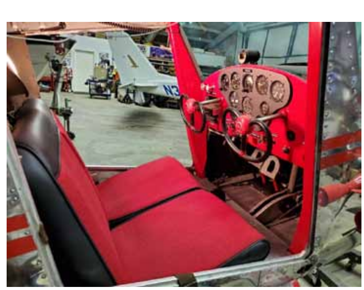
Another view with seats in.