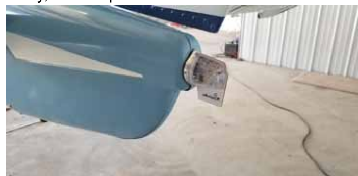
August 2020—page 8 (on-line only)