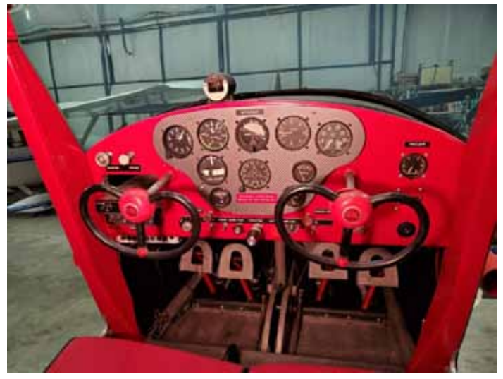
I may have used a "bit more red paint" than "factory new" ever did.