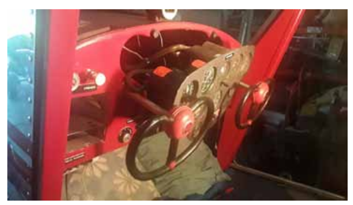
Reinstall instrument panel with a few reconditioned/ tagged instruments.